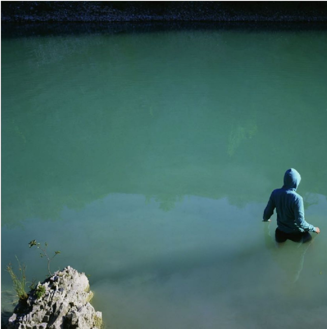
Trial II 2008 Pigment print 60 x 60 cm Edition of 5 + 1 AP