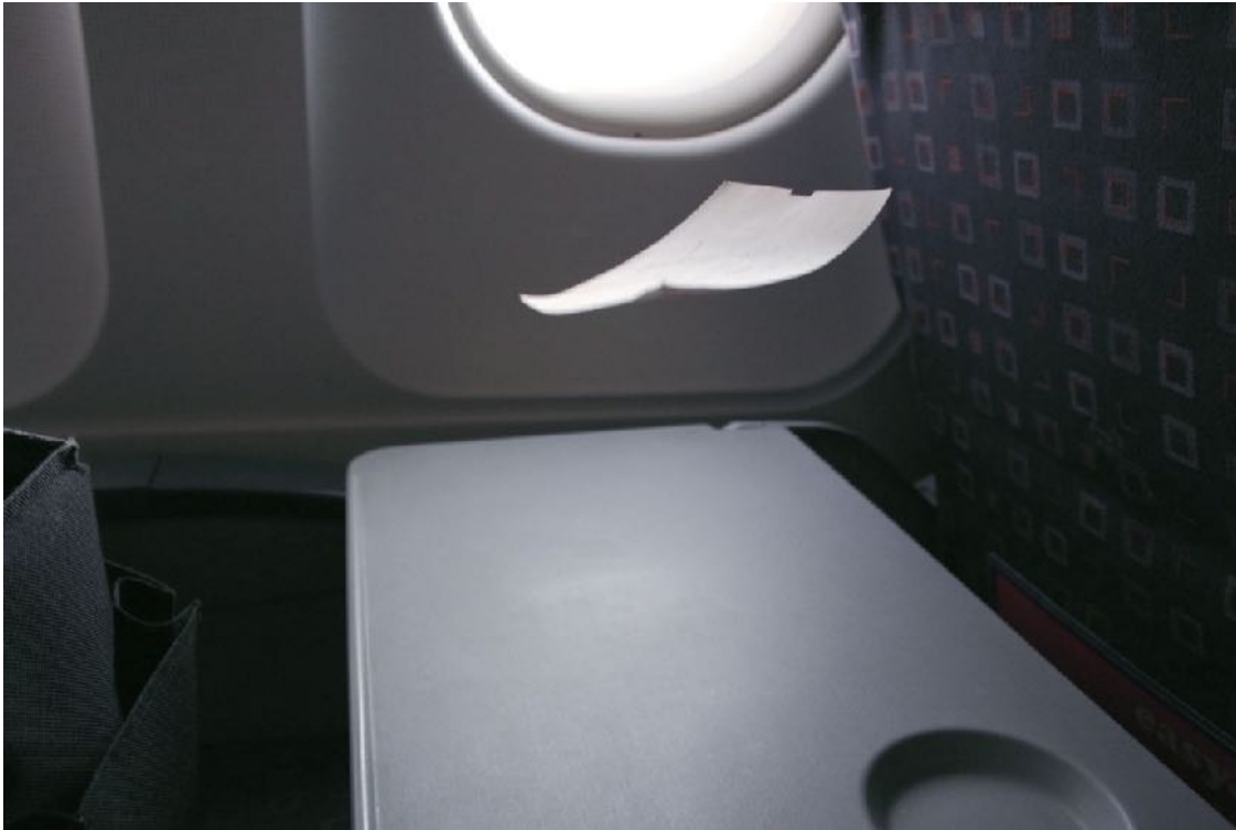
Easy II 2009 Pigment print 12 x 18 cm Edition of 5 + 1 AP