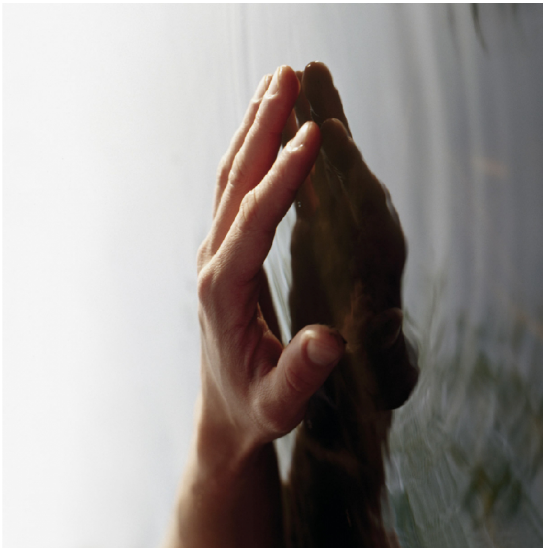
Hand II 2009 Pigment print 30 x 30 cm Edition of 5 + 1 AP