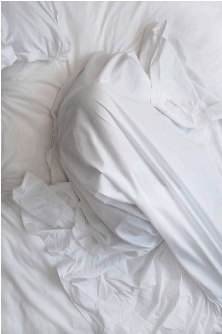
Pol II 2011 Pigment print 30 x 45 cm Edition of 5 + 1 AP