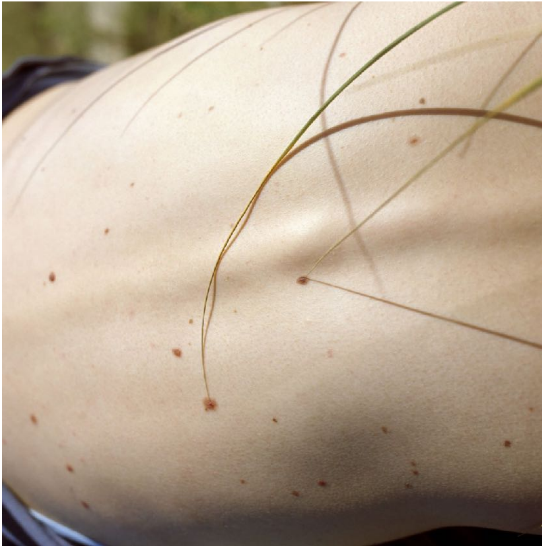
Marked II 2007 Pigment print 70 x 70 cm Edition of 5 + 1 AP