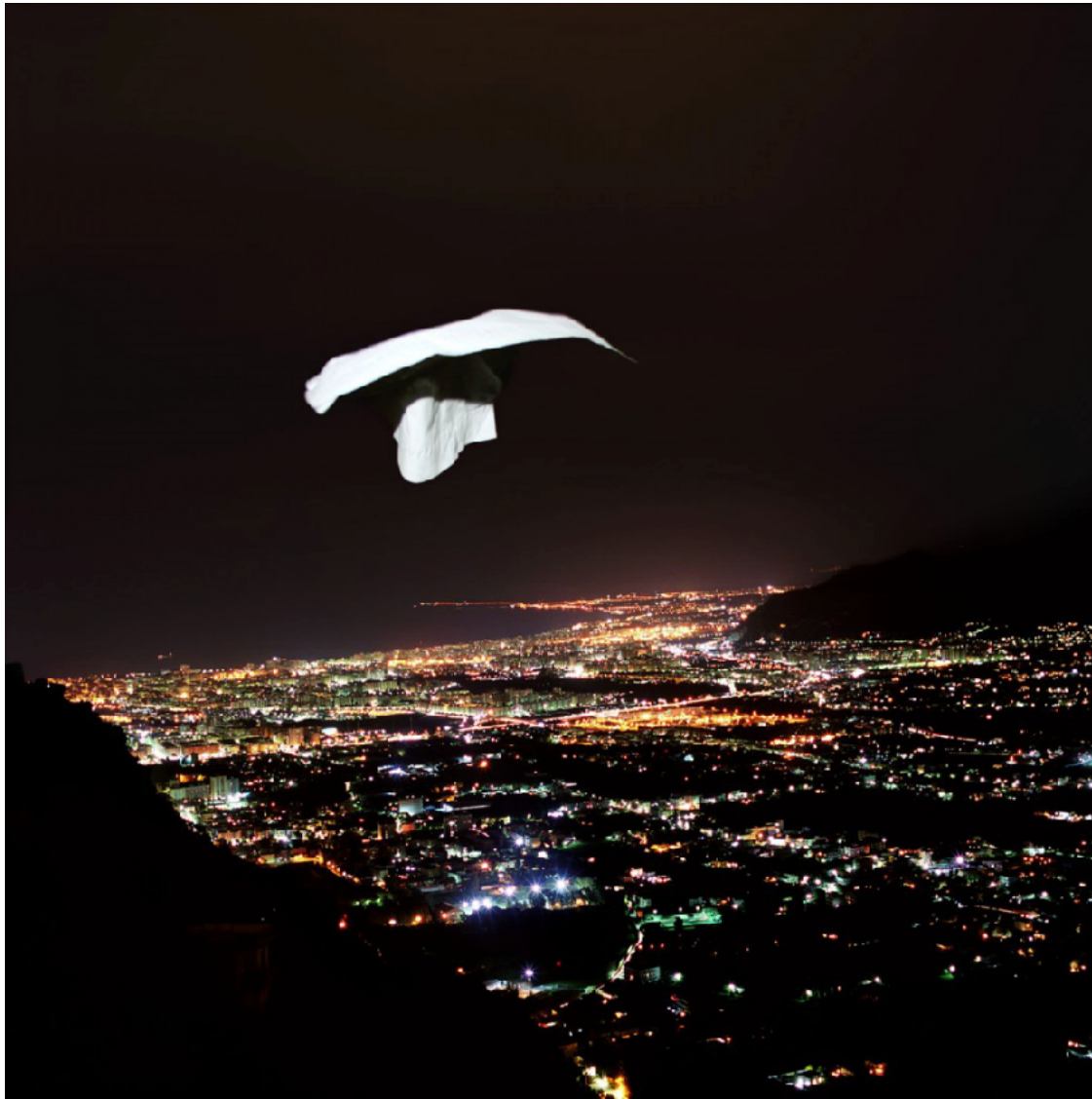
Adieu II 2009 Pigment print 40 x 40 cm Edition of 5 + 1 AP