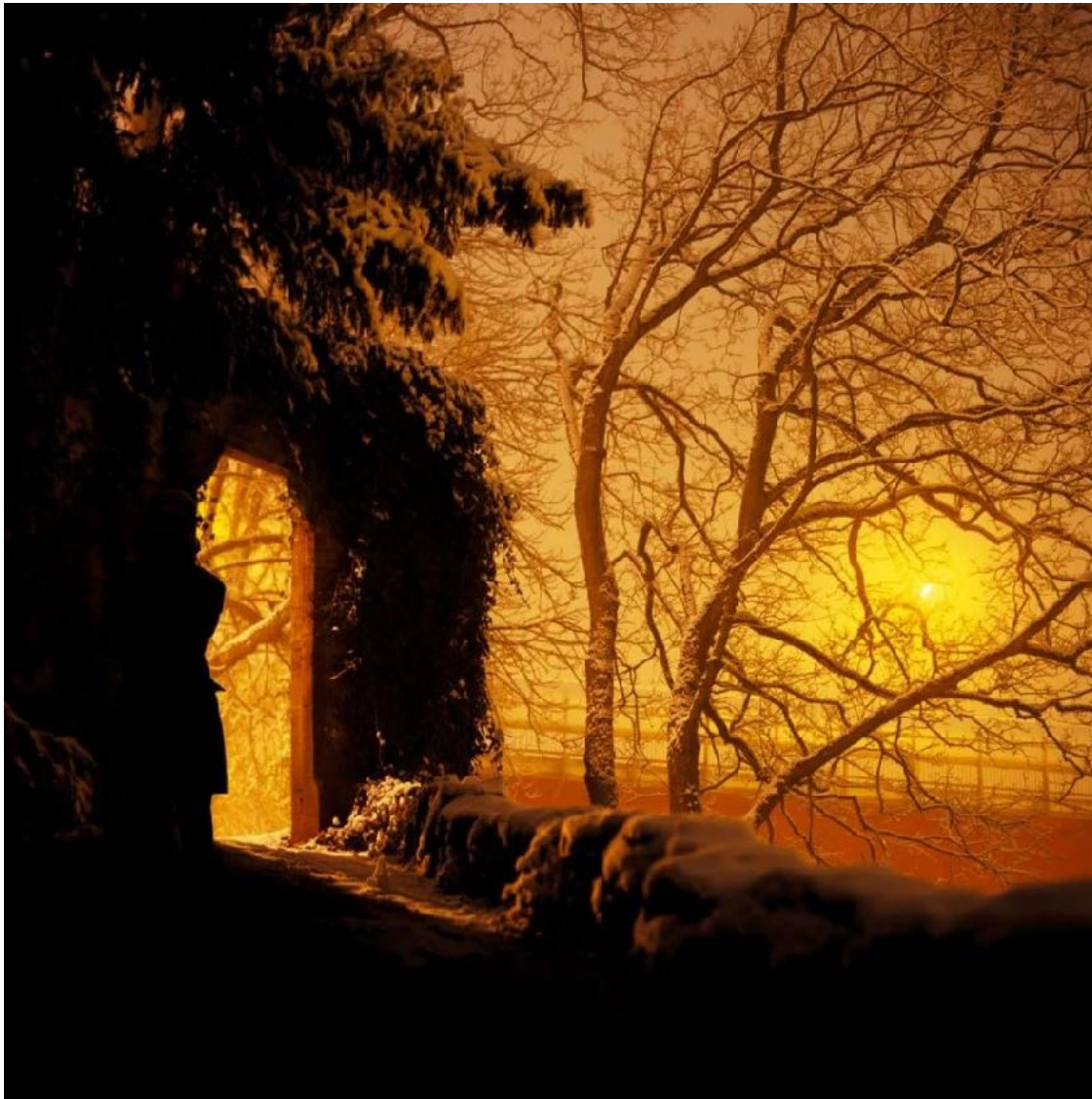
Caché II 2010 Pigment print 110 x 110 cm Edition of 5 + 1 AP